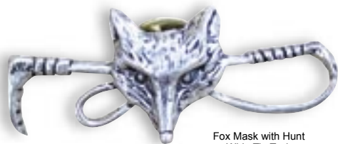
Fox Mask with Hunt Whip Tie Tack

The hunt whip complete with tongue and lash is most appropriate to suit the formality of these classes, however a cane may be carried instead if desired. Both ladies and gentlemen should of course wear a waistcoat with the bottom button left undone.