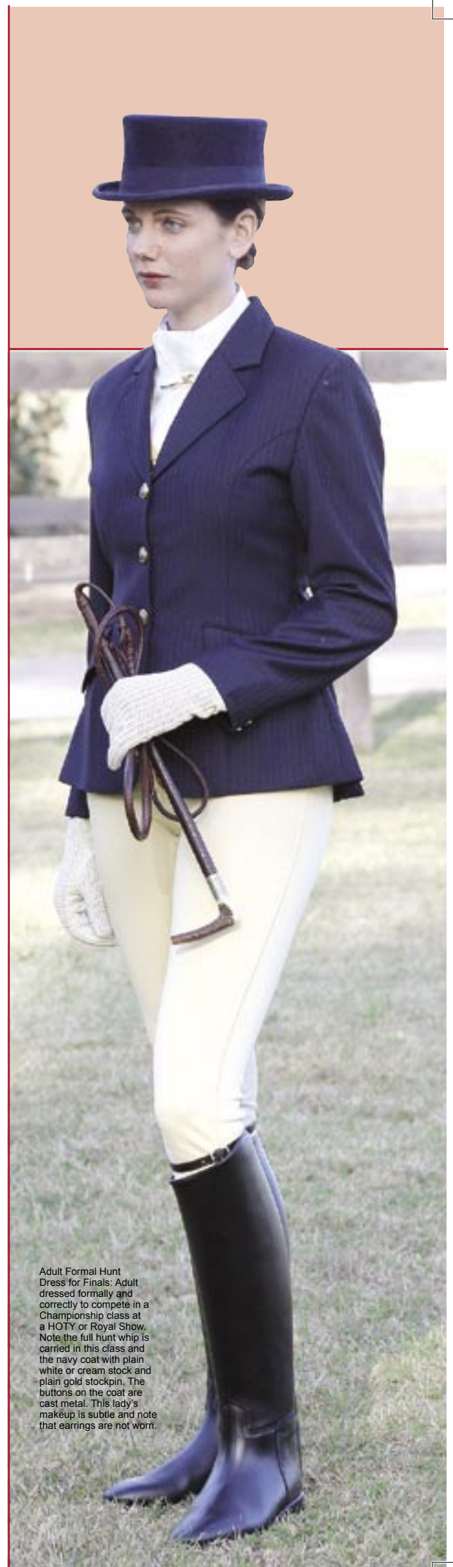
Adult Formal Hunt Dress for Finals: Adult dressed formally and correctly to compete in a Championship class at a HOTY or Royal Show. Note the full hunt whip is carried in this class and the navy coat with plain white or cream stock and plain gold stockpin. The buttons on the coat are cast metal. This lady's makeup is subtle and note that earrings are not worn.

In the writing of this article, please remember that it is a guide only with points taken from New Zealand, the United States and the United Kingdom and general common sense would certainly apply to appropriate attire for a hunter class in Australia. In regard to the issues of headwear in Australia, naturally most shows require the rider to wear a safety approved helmet and if no specification is made in regards to this in the regulations of the programme. It is then obviously up to individual choice as to what headwear is chosen. As long as a workmanlike appearance forms the basis of your turnout, and the class is not a hunt turnout class, it is doubtful you would lose a class if you chose to use or not use any of the following points.