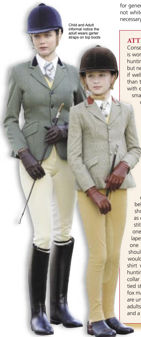
Child and Adult informal notice the adult wears garter straps on top boots